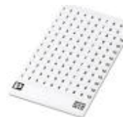
Marker card, Card, white, labeled, Horizontal: Consecutive numbers 1 - 10, 11 - 20, etc. up to 91 - (99)100, Mounting type: Adhesive, for terminal block width: 5 mm, Lettering field: 5 x 3.8 mm

Marker card - SK 5/3,8:FORTL.ZAHLEN - 0804183